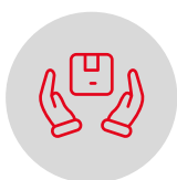
Packing with specialized techniques