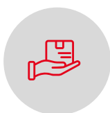
Collection of goods on request