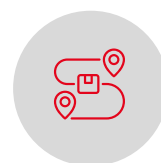
Tracking shipments to their destinations