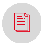
Transport document management