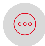
and much more